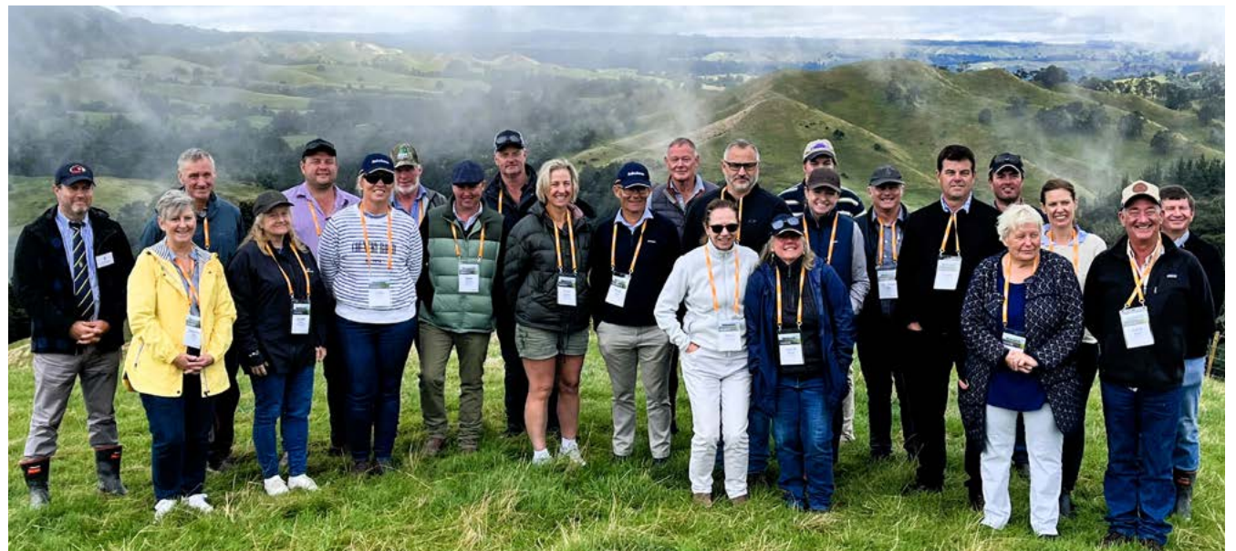
BMP Alumni Tour, Hawke's Bay, NZ 2024