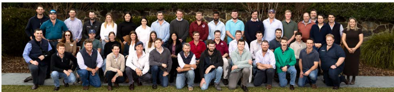
2025 Farm Managers Program, Course 20

Stud Administration and Livestock Hand, Ardrossan Angus Walwa, Victoria, Australia